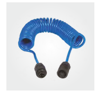
Cen-Stat cable supplied with male and female in-line Quick-Connects.

The spiral cable provides effective retractability when the clamp is not in use, ensuring the cable is neatly stowed and safely out of the way.