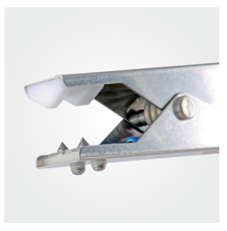
Tungsten Carbide Teeth