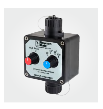
Universal Resistance Tester Product Code: URT.