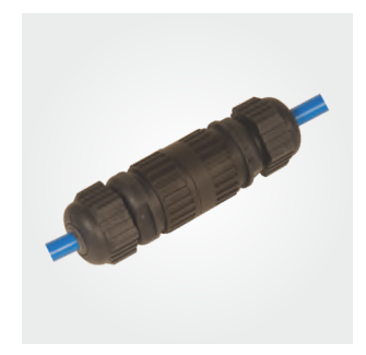
In-Line Quick Connect.

The Bond-Rite® EZ forms part of the Bond-Rite® range of Static Grounding and Bonding Equipment available from Newson Gale